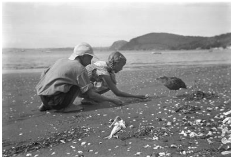
Children and tame gull on Cornwallis Beach, 1957.

As well as rare and historic books Auckland Libraries' Heritage Collections feature maps, manuscripts, archives, photographs, drawings, oral histories, musical recordings and ephemera. In 2017 two collections from Auckland Libraries, the John A. Lee archive held in Sir George Grey Special Collections and the J.T. Diamond collection at the Waitākere Central Library, were added to the NZ Register of the Memory of the World .