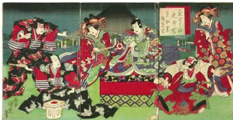
Covers of three Japanese illustrated woodblock books forming a triptych

Now in its sixth year, this scholarship is offered by the Auckland Library Heritage Trust to assist with research and the promotion of material held in the Sir George Grey Special Collections at the Central City Library and the distributed heritage collections across Auckland Libraries. Heritage collections are found at the north, south and west research centres at Takapuna, Manukau and Waitākere libraries.